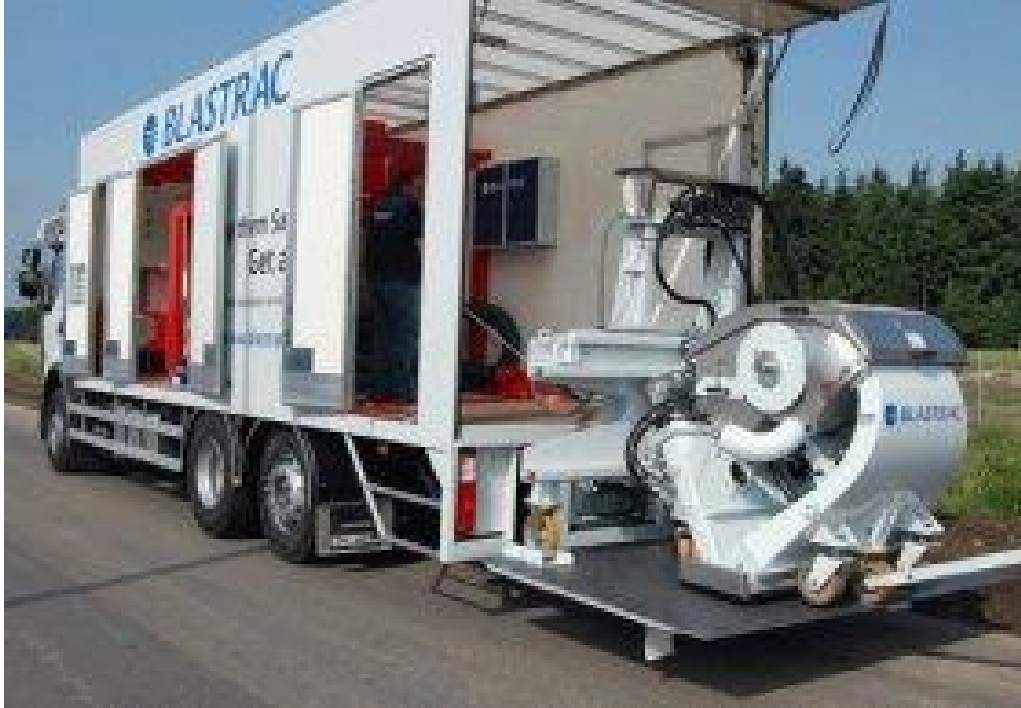
Photo 2 Blasting unit in rear of lorry

The maximum width that can be treated in a single pass is 1150 mm. The blaster unit weighs 1750 kg. It can be adjusted in width so as to treat the whole width of a lane. Operating speed can be varied between 0.5 and 40 m/min.