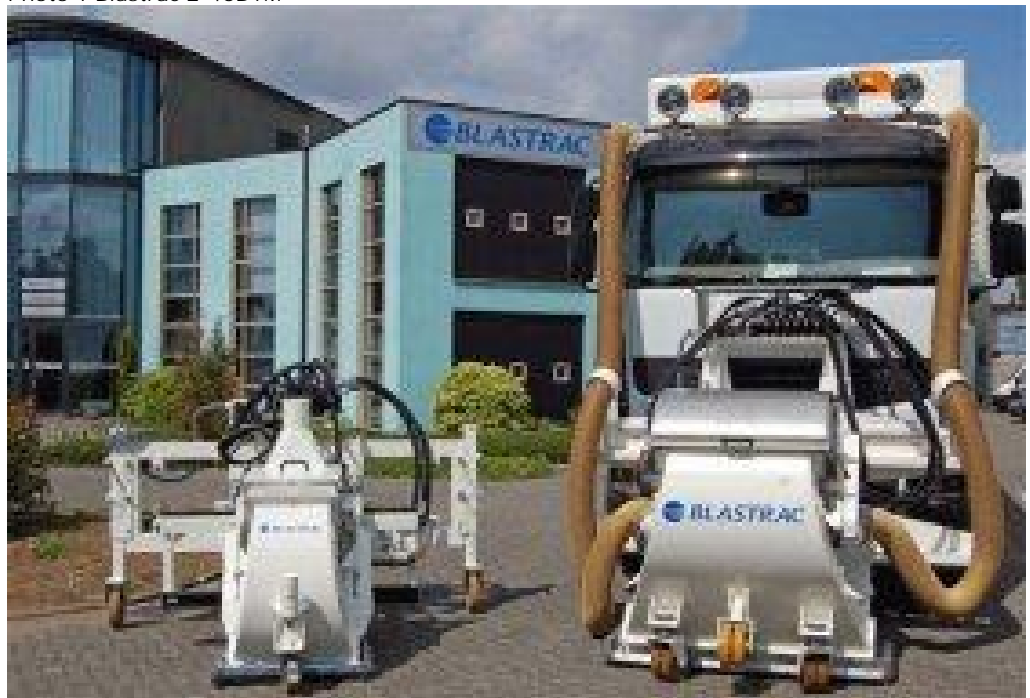
Photo 1 Blastrac 2-45DTM

Between jobs the blaster unit can be removed for transport in the rear of the lorry. See Photo 2.